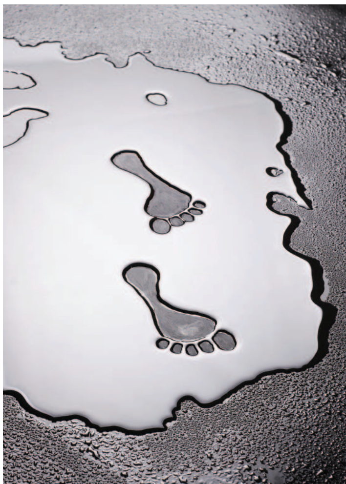
Figure 1. Water footprint: water use to produce goods for human consumption (source: © 2008 iStockphoto.com/sandsun).

The water footprint of an animal at the end of its lifetime can be calculated based on the water footprint of all feed consumed during its lifetime and the volumes of water consumed for drinking and, for example,