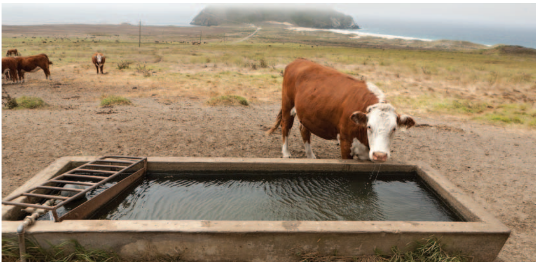
Figure 4. Drinking water contributes only 1% to the total water footprint of beef.

Problems of water scarcity and pollution always become manifest locally and during specific parts of the year. However, research on the relationships between consumption, trade, and water resource use during